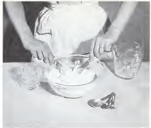
N-39869--For basic mix combine dry ingredients with shortening.